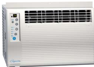
Compact-Aire 5,000-10,000 BTUH