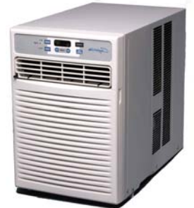
Power-Aire® Casement Series 8,000-12,000 BTUH