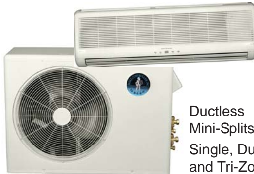
Ductless Mini-Splits Single, Dual and Tri-Zone 9,000-36,000 BTUH