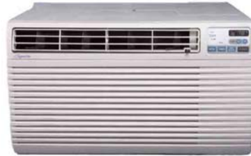
Power-Aire® Builder 8,000-12,000 BTUH Thru-the-Wall