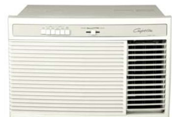
Power-Aire® Heat Pumps 12,000-17,600 BTUH