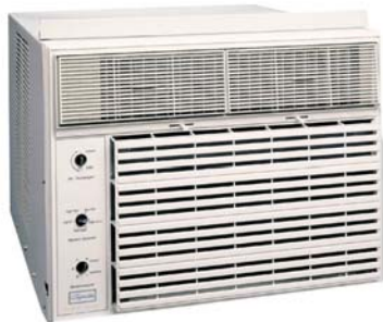
Super Power-Aire® 32,000-36,600 BTUH