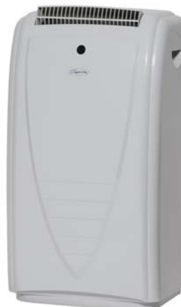
Portable-Aire® 9,000-12,000 BTUH with dual hoses