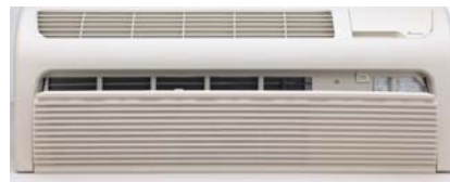
PTACs—A/C & Heat Pump 7,000-15,000 BTUH