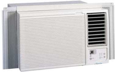
Power-Aire® 12,000-28,500 BTUH