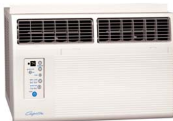
Power-Aire® with Electric Heat 8,000-24,000 BTUH