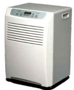
Dehumidifiers 30, 50 and 65 Pints Per Day