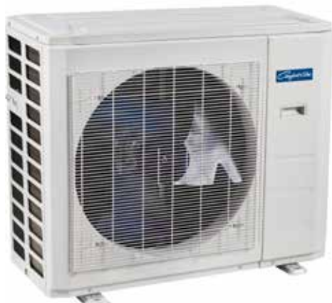
12,000, 18,000, 24,000, 30,000, 36,000 BTUH

1 Oil traps must be installed every 10 feet when outdoor unit is installed above indoor unit.